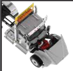
All trucks feature opening hoods and detailed engines.