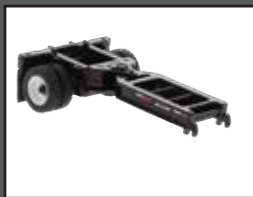
All trailers come with snap-on single-axle and double-axle rear boosters.