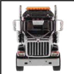
Oversize Load signs can be removed from tractors and trailers.